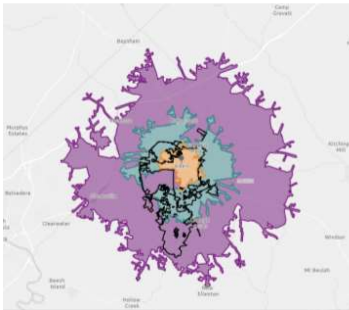
Figure 1. Aiken Trade Area Geographies

The City of Aiken is a city of 32,000 residents located in western South Carolina. Characterized by its rich history and small-town charm, the city serves as a retiree and tourist destination, and is an emerging focal point for high-tech cluster which has drawn a new, highly educated workforce to the Aiken-Augusta metro area. Geographies for this snapshot include the City of Aiken in context with three trade areas defined by driving radius from downtown at 0-2 miles , 2-5 miles , and 5-10 miles .